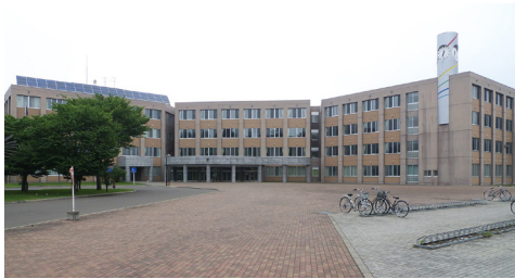
Entrance of Hokkaido Obihiro Hakuyou High School.